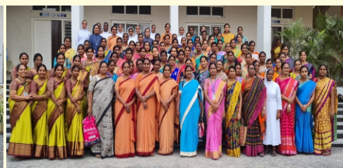
NRT ZONE PRIMARY TEACHERS WORKSHOP