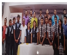
District level – Quiz competition 2 nd prize (IX and X students)