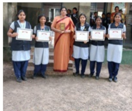
Spell Bee competition 2 nd prize – (class X)