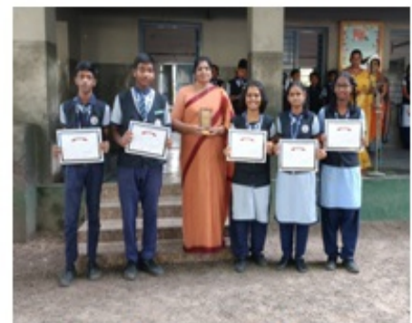
Spell Bee competition 3 rd prize (class X)