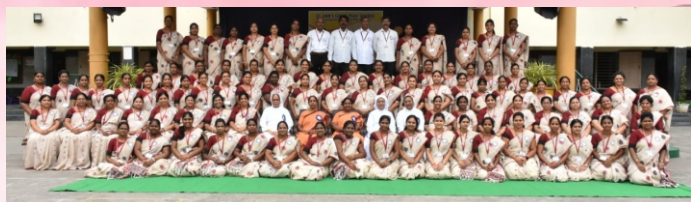
VIJAYANAGAR COLONY, HYD