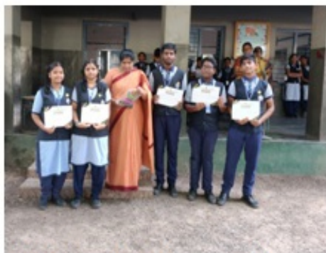
District level – Quiz competition 2 nd Prize – (IX and X students)