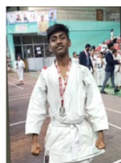
Karate - State level