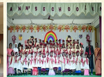
VNC - Hyderabad