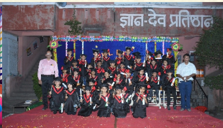
Nandura - Maharashtra