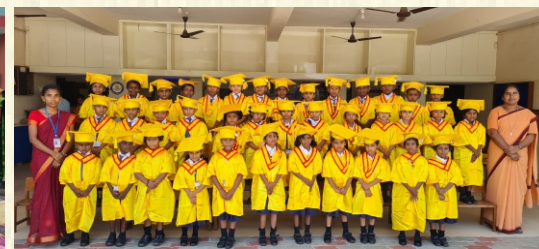
Madanandapuram - Chennai