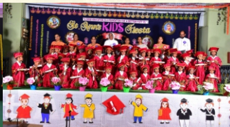
Bharatpet - Guntur