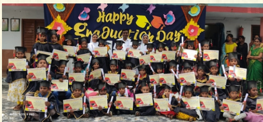
Nuzvid - Krishna Dist.