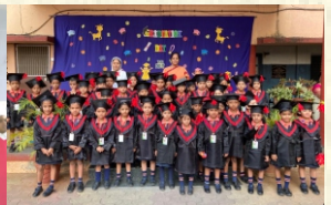
Gass - Bombay