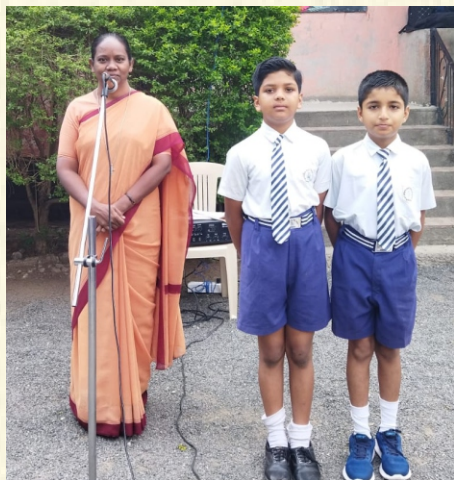
St. Ann's, Nandura, Maharashtra

The Navodaya Vidyalaya System is a unique experiment unparalleled in the annals of school education in India and elsewhere. Its significance lies in the selection of talented rural children as the target group and the attempt to provide them with quality education comparable to the best in a residential school system.