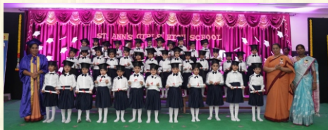
Asif Nagar - Hyderabad