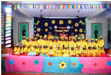
Mangadu - Chennai